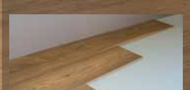
SILENZIO® PLUS SYSTEMBOARD