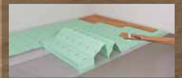
SILENZIO® SYSTEM UNDERLAY